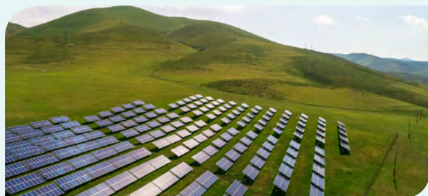
The winning photo: solar panels in the mountains, Armenia

Hrant Sahakyan, the winner of the #EU4Energy photo competition