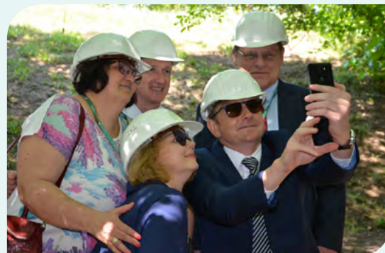
The EU Delegation to Ukraine team at the official EUSEW 2019 opening in Mykolaiv, 1.06.2019